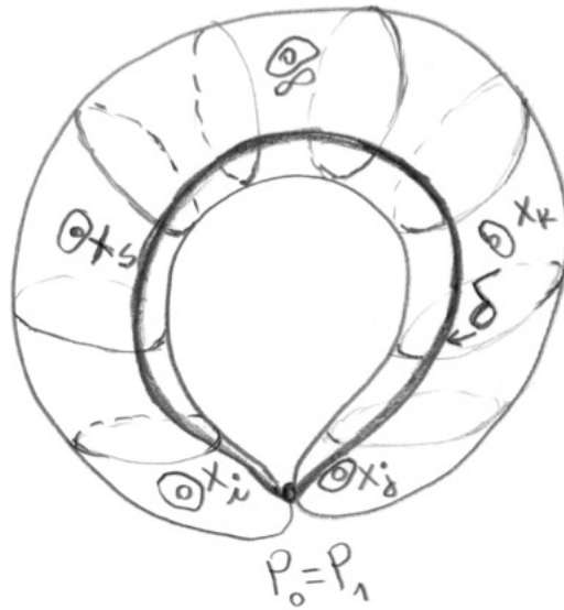
Figure 3.1. The singularized algebraic curve \Gamma_h^{sing} .

sheaf of \Gamma_h , except at the point m \in \Gamma_h^{sing} . A function f on \Gamma_h^{sing} is said to be regular, if it is regular on \Gamma_h , and moreover f(P_0) = f(P_1) . The path [0, 1] connecting the points x = 0 and x = 1 closes on the singular algebraic curve \Gamma_h^{sing} . The function I(h) defined in (3.6) is an Abelian integral on \Gamma_h^{sing}