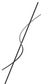
Figure 2.1. The twisted cubic drawn in green is hyperbolic with respect to the red line.