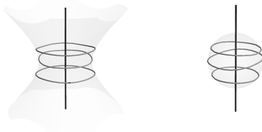
Figure 2.2. The two canonical curves of genus four from Examples 2.13 (left) and 2.14 (right) with real part having three connected components that are hyperbolic with respect to the red line. The curve on the left has (1, 1, 1) in its separating semigroup whereas the one on the right does not.

Let X be the complete intersection of S and Q . Then the resulting curve X is again hyperbolic with respect to the line E defined by x = y = 0 and we have (2, \dots, 2) \in \text{Hyp}(X) . See the right hand side of Figure 2.2. As in Example 2.13, the curve X has genus (k-1)^2 and X(\mathbb{R}) has k connected components. But we will show that unlike in the preceding example, we have (1, \dots, 1) \notin \text{Sep}(X) if k > 2 . In fact, there is no real morphism X \rightarrow \mathbb{P}^1 of degree k . Any complex line on Q intersects X in k points and the projection from this line gives a map to \mathbb{P}^1 of degree k . The gonality of the complexified curve is k and every morphism X \rightarrow \mathbb{P}^1 of degree k comes from the projection from a line by [3] and [6]. However, since the surface Q does not contain any real lines, there are no real lines intersecting X(\mathbb{R}) in more than two points proving the claim that there are no real morphisms of degree k to \mathbb{P}^1 .