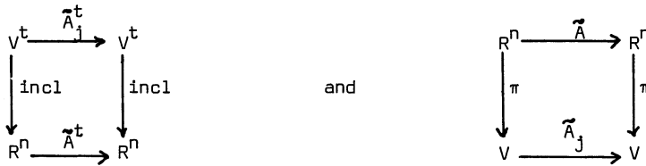
diagram notation we have

where \text{incl} is an inclusion and \pi is a surjection.